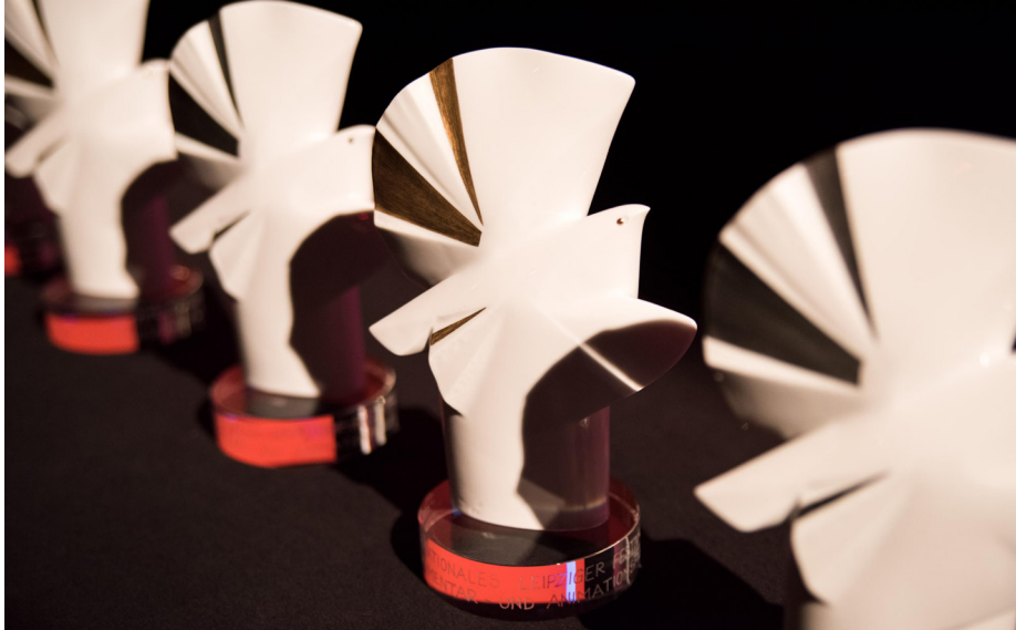
Golden and Silver Doves

Long animated film “Pelikan Blue” receives Golden Dove | Long film “Tarantism Revisited” wins the German Competition | Audience jury honours “Once upon a Time in a Forest”