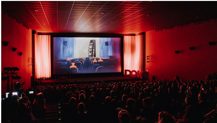
DOK Leipzig 2024

The 67th edition of the documentary and animated film festival DOK Leipzig was exceptionally well received by audiences and members of the film industry. The festival drew a total of 55,000 filmgoers this year – more than ever before.