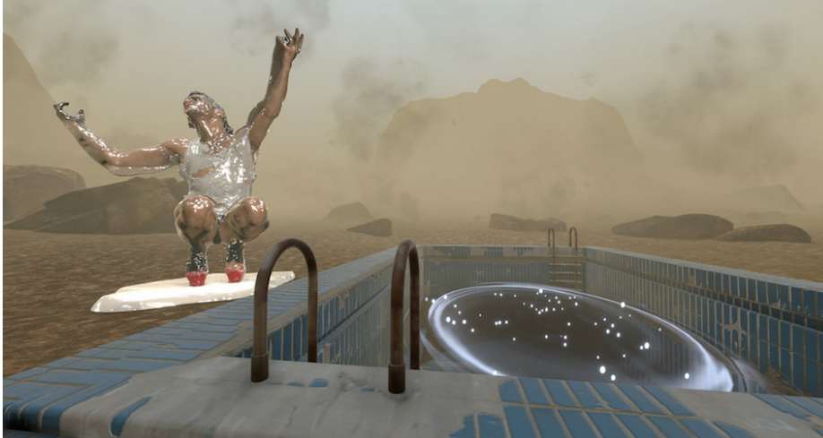
DOK Leipzig 2024 | Glitchbodies (Creator: Rebecca Meric)

DOK Exchange XR Expands to Two Days, XR Prototyping Zone Makes Debut